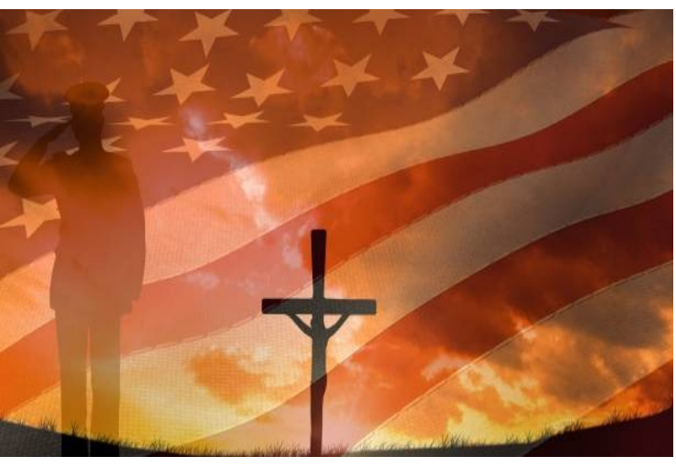
As we remember and honor those who gave their ALL for our freedom, let us also remember and honor the ONE, who died so that ALL may be free.