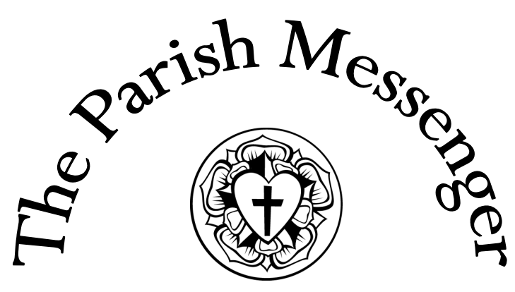
St. John's Lutheran Church, Belleville, Pennsylvania