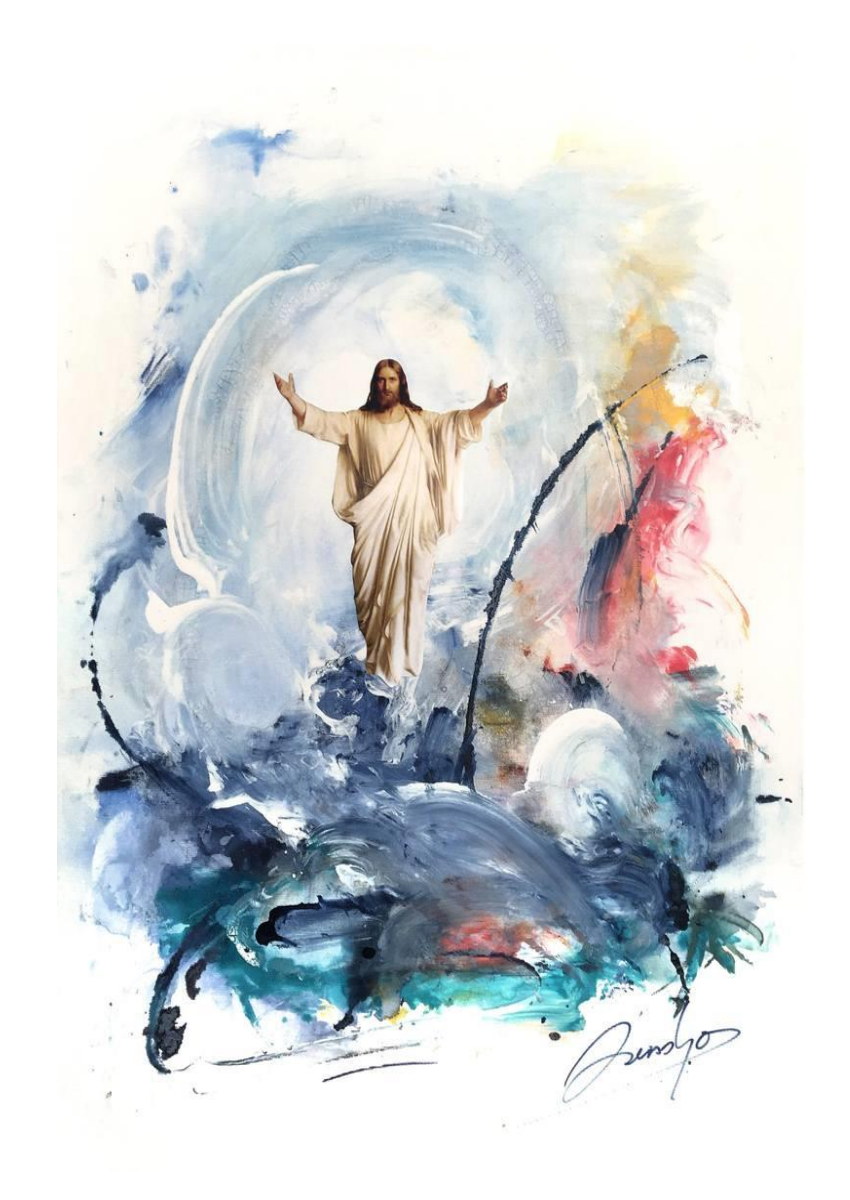
Fifth Sunday after Pentecost June 23, 2024

St. John's Lutheran Church Belleville, PA