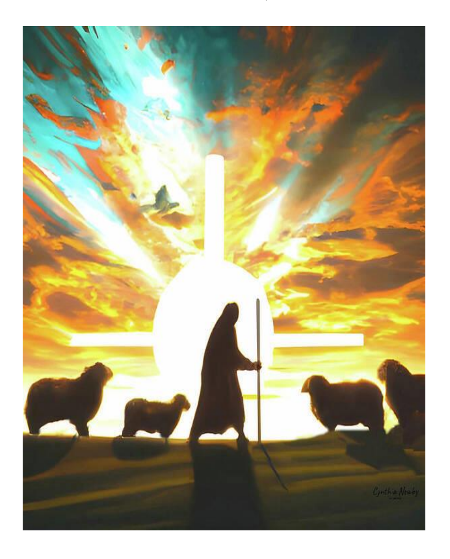
Fourth Sunday of Easter April 21, 2024