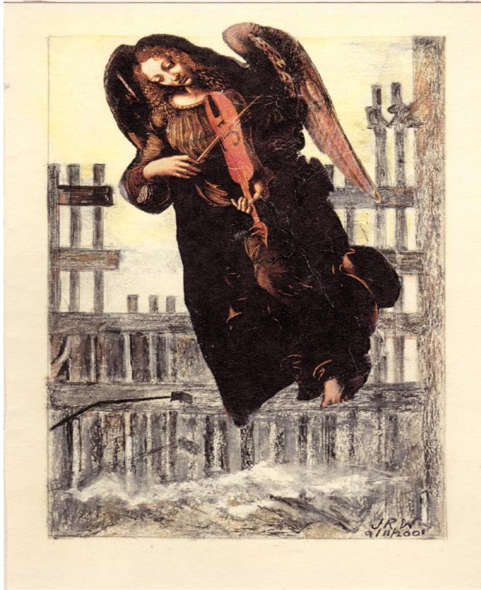
Elegy for the Innocents.