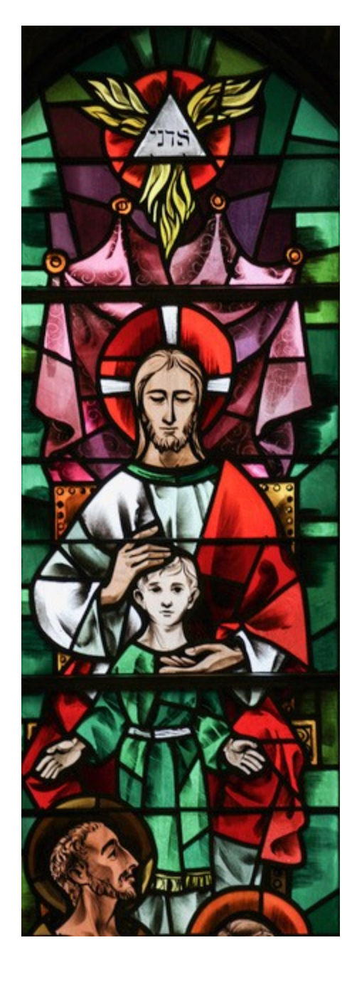
SIXTH SUNDAY AFTER EASTER MAY 17, 2020

CALL TO WORSHIP – Sunday morning Belleville Bells ~ 10:00am